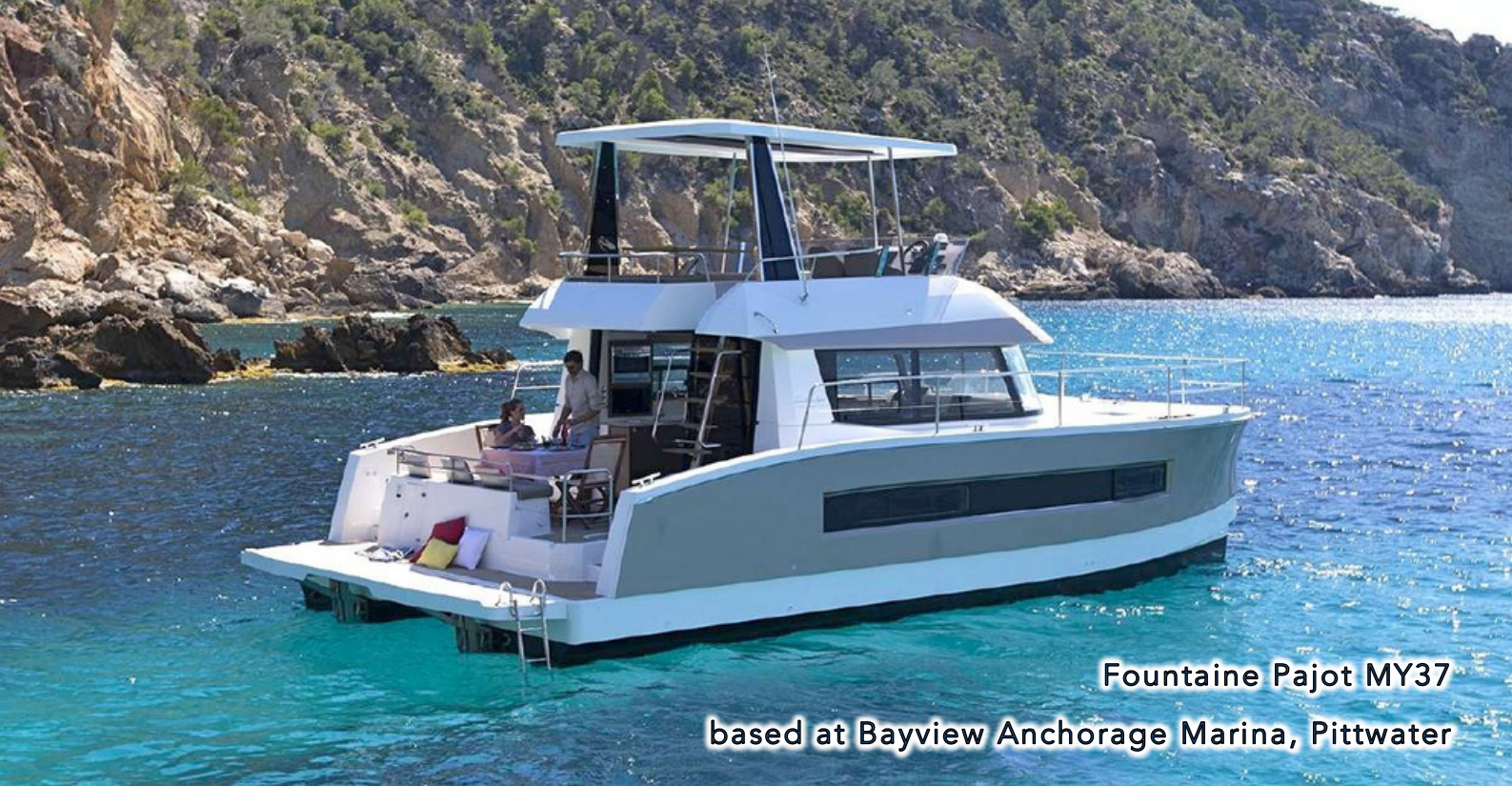
Fountaine Pajot MY37 based at Bayview Anchorage Marina, Pittwater