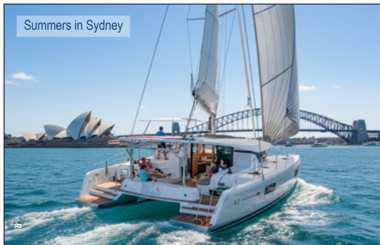
Summers in Sydney

SMART BOATING takes care of it all - it's what we do and we're very good at it!