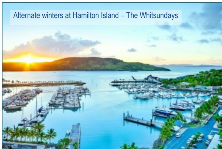
Alternate winters at Hamilton Island – The Whitsundays